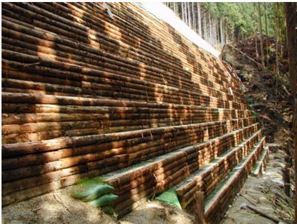
Retaining wall with a near-vertical wall face constructed with recycled plastic logs.

Or contact us at: Shuwa Shiba Park Building 2-4-1 Shiba Kohen, Minato-ku Tokyo, Japan Tel: 81/3 3578 7765 Fax: 81/3 3578 7766